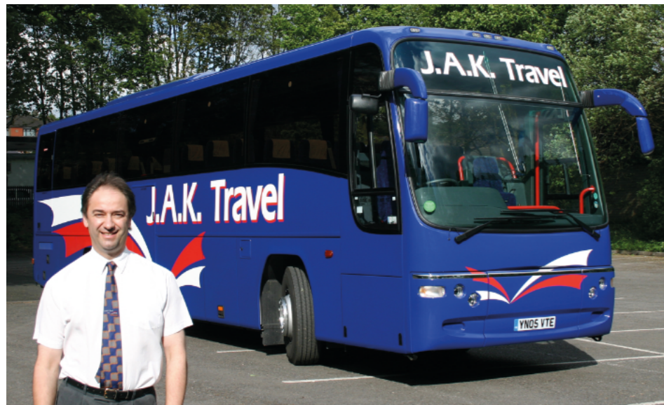
" Well at least VTE looks to have aged well!"

belted seats, full climate control, and an on board toilet. The feedback so far from travellers is that it is a very comfortable and quiet coach to travel in. Like VTE it is nice to drive, with plenty of power, huge luggage compartments but a myriad of switches to get to grips with on the dash! It has a Euro6 engine, so no problems with emissions in the Bradford Clean Air Zone, and others that are now in force elsewhere in the country. We hope you will enjoy your time travelling on this vehicle.