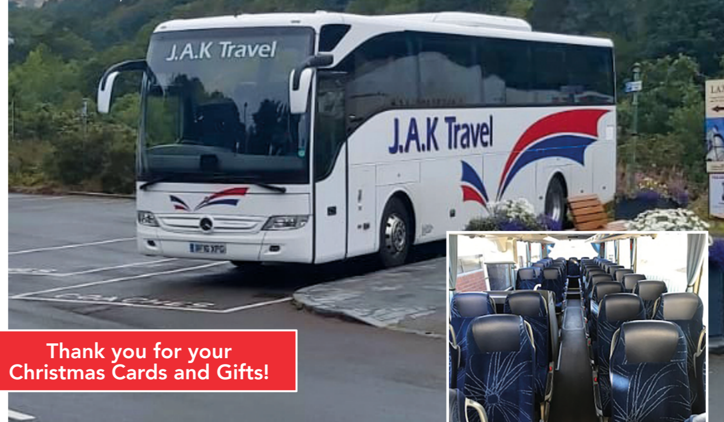
Our latest vehicle, Mercedes Tourismo.

Thank you for your Christmas Cards and Gifts!